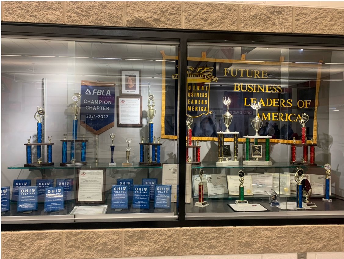
Harvey High School has had 3 first-place award winners in Future Business Leaders of America state competitions.

news or social media. These articles and posts can then be sent to perspective mentors to demonstrate the students' work.